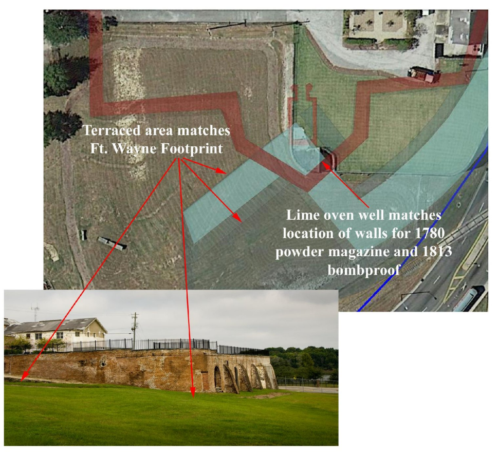
Figure 10 View of fortification overlay, above, and lateral view of terraces. Google Earth image, to, J Byous Company, lower.

It is recommended that a closer look at the possibility that the bricks on the western section of the Lime Oven well be studied for ties to the 1780 Fort Prevost powder magazine and the 1814 Fort Wayne bomb proof.