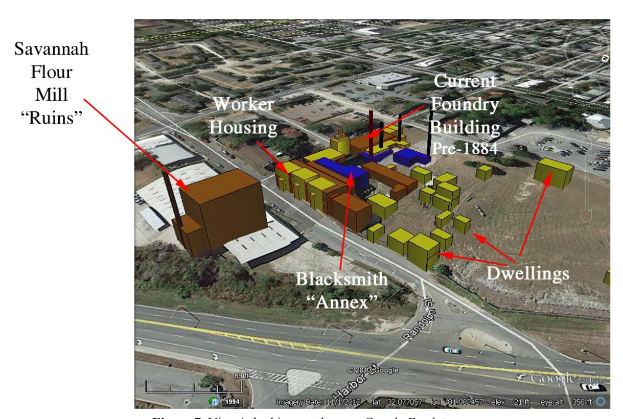
Figure 7 View is looking southwest. Google Earth image.

By 1898 three buildings were added to the Works including a wood-frame, partially-iron-clad blacksmith shop that covered the area that now holds the Annex section presently under renovation. Also added was a "fitting" building and another with a coke oven marked by the two smoke stacks on the right middle of the picture.<sup>6</sup>