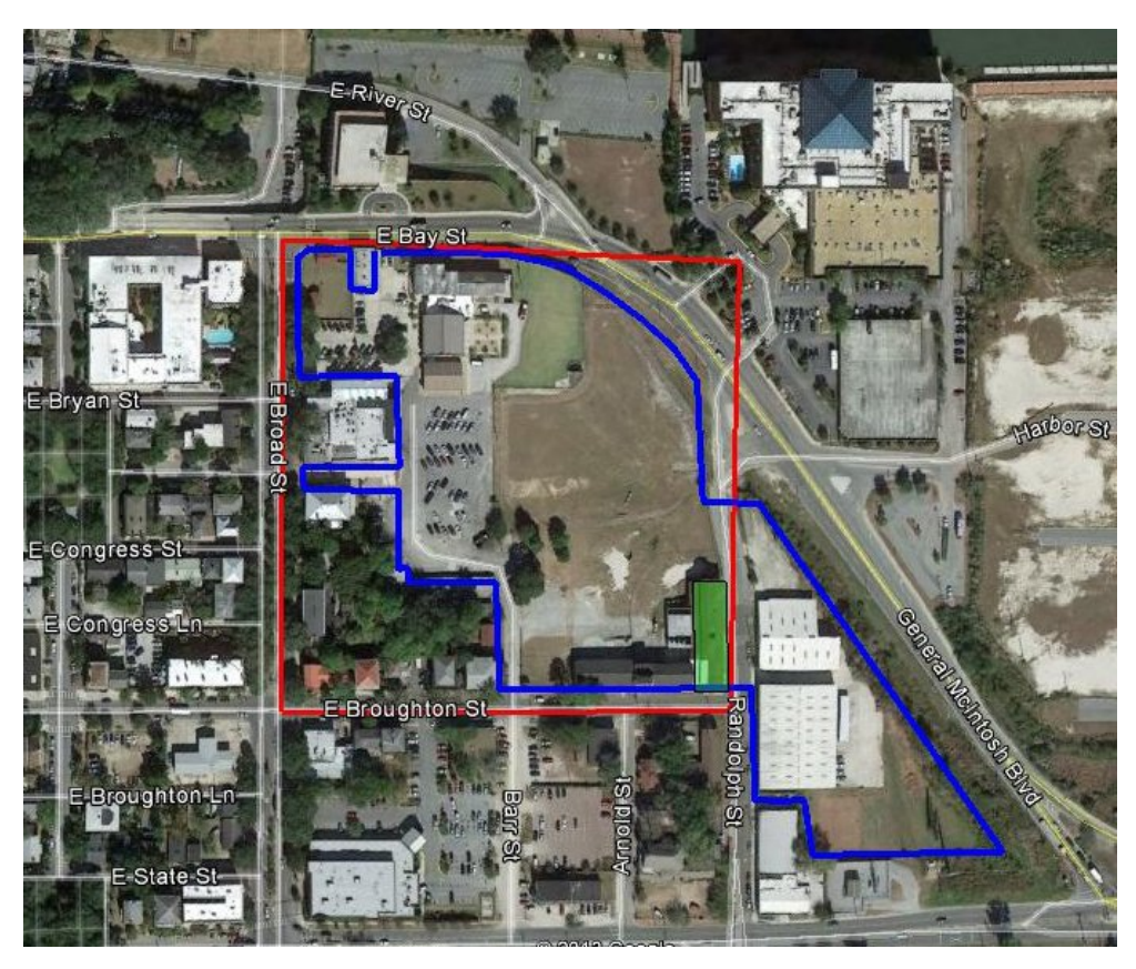
Figure 1. Above, is an aerial view of the Trustees' Garden. The area marked in red indicates the topography that may have approximated the ten-acre boundary of the original Garden. The blue line shows the bounds of the property in the current project.

Arguably the most historic spot in Savannah, Georgia and the Southeast, the ten acres known as Trustees' Garden must be considered as unique in its role in the story of America. In the 281 years since 1733 and the founding of the British Colony the sloping terrain has been built upon again and again. It was the site of the first agricultural experimentation site in the New World when it was created by James Oglethorpe and the Georgia Trustees. The area at the bottom of the image below shows various buildings that made up the Kehoe Iron Works. This report studies the building sequence of that section of the Garden project. The buildings at the top of the image are those of the Manufactured Gas Works first built in the late 1840's. Today the Gas Works serves as the Charles H. Morris Center. The multiple military fortifications on the site will be reviewed in a later report.