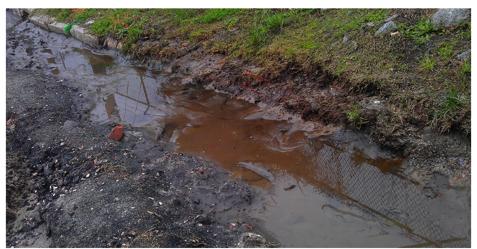
Figure 3 & figure 4 Though Savannah's water level is lower today than it was in 1734, water still seeps from the hillside at the base of Trustees' Garden matching Moore's description of "fine Springs" in that area. A close up view of the seepage along Randolph Street is seen in the top photo, figure 3, with a wider view in the lower, figure 4.

Also described in the narrative are a variety of plants from England that grew in the Garden. They included apples, pears, figs, grapes and pomegranates. Exotic plants studied on the site included coffee, olives, coconuts, cotton, palms and tea. Tea was the only failing herbaceous plant mentioned by Moore. It refused to survive in the Georgia climate.