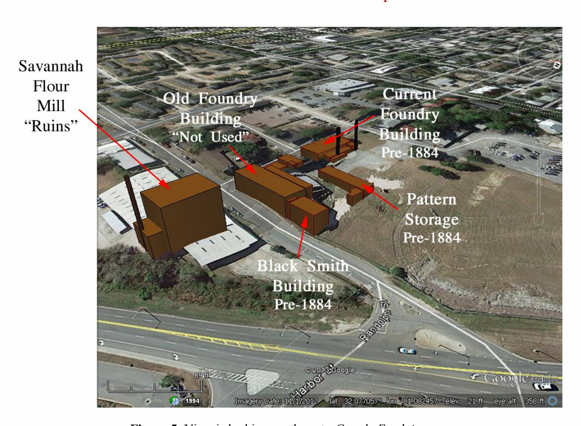
Figure 5 View is looking southwest.